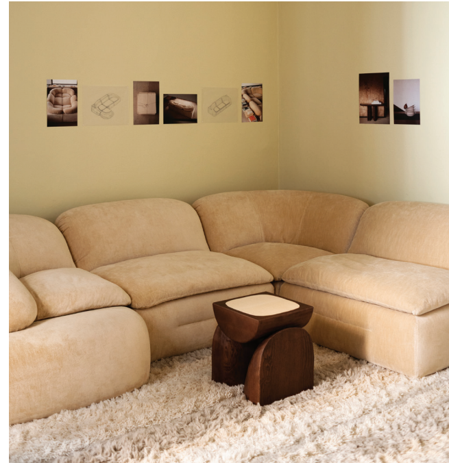
Bread & Butter collection Tacchini

Known for her whimsical, eye-catching designs, British designer Faye Toogood's latest collection for Tacchini – which debuted at this year's Salone del Mobile – is inspired by the therapeutic act of baking bread and slabbing a fresh loaf with soft butter. "Some people have transcendental meditation or prayer," says the multidisciplinary creative. "I have my sourdough starter and half an hour of sticky, squashy, floury, sensory, in-the-present pleasure." This momentary practice has been stretched into the form of the Butter sofa, an inviting modular lounge to melt into, and the Bread console and Butter side tables, all carved from stained ash wood with maple inlays.