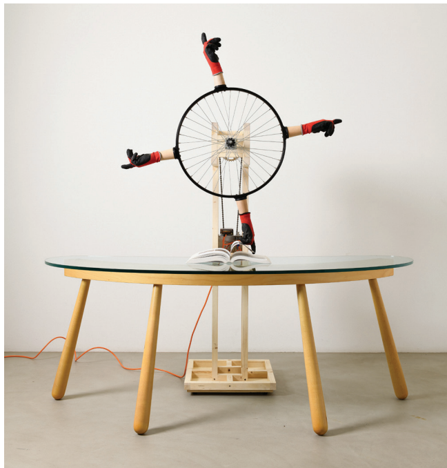
Boomerang desk Enzo Mari

Gebrüder Thonet Vienna (GTV) has reissued Enzo Mari's 2001 Boomerang desk, which is celebrated for its warmth and simplicity. The desk embodies the Italian artist and designer's dedication to pure forms and rational construction. It features a curved glass top resting on a boomerang-shaped beechwood plank, supported by four rounded legs. Presented at this year's Salone del Mobile, the release underscores both Mari's and GTV's enduring influence. The desk's organic shape and use of natural materials balance function and aesthetics, making it a statement piece while staying true to Mari's vision of accessible, intelligent design.