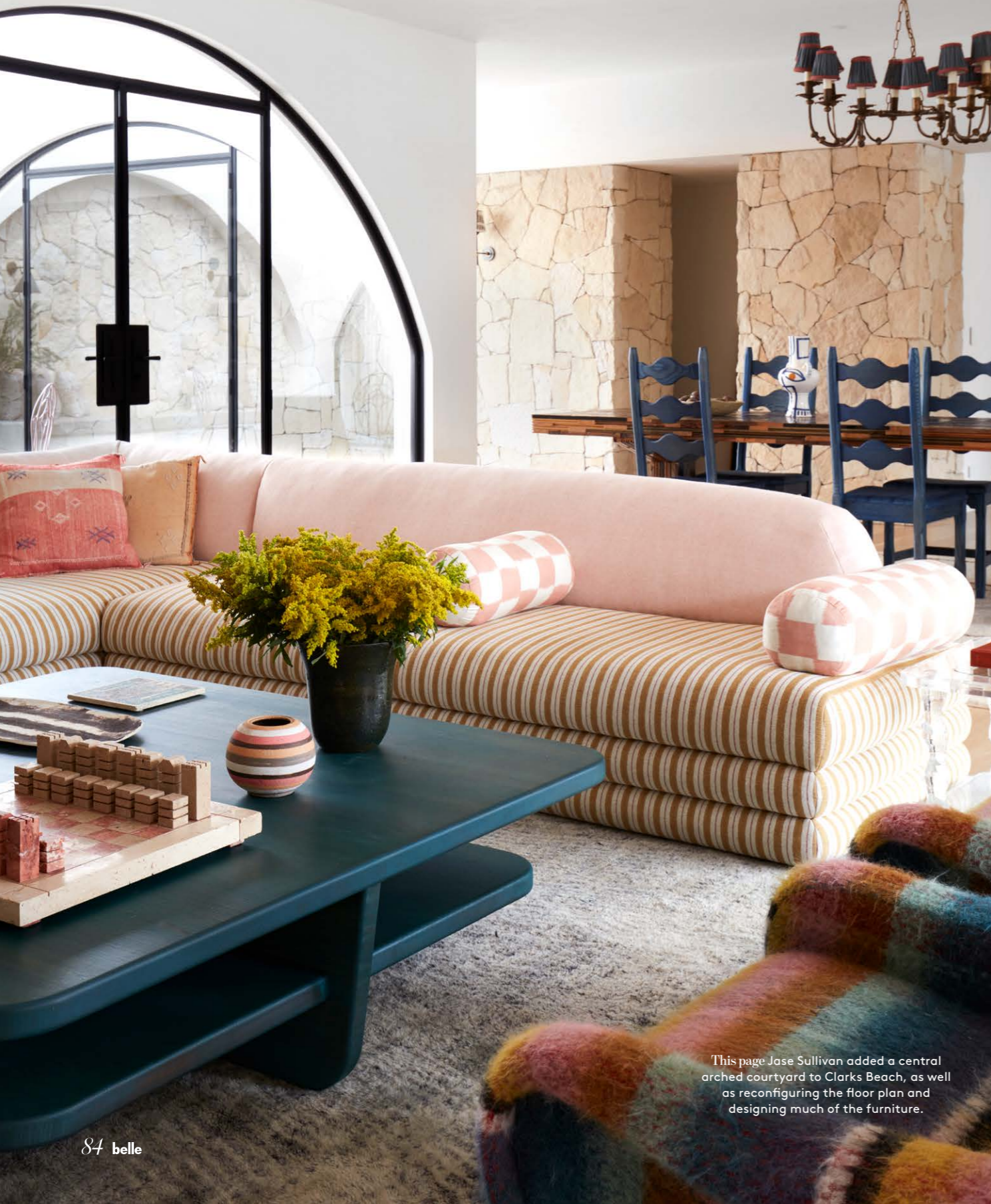
This page Jase Sullivan added a central arched courtyard to Clarks Beach, as well as reconfiguring the floor plan and designing much of the furniture.

A SUN-BLEACHED, MEDITERRANEAN-INSPIRED PALETTE permeates every inch of this redesigned Byron Bay home by Jase Sullivan. From the powder-blue kitchen joinery to the peach-hued bathroom tiles and cheery pink scalloped umbrellas by the pool, the effect is retro-chic personified, and a vast improvement on the original dated mid-century home that the owners inherited. Jase custom-designed much of the furniture for the Clarks Beach project, including a tri-toned sofa, deep blue dining chairs and coffee table, and wavy, striped bedhead. To this, he added vintage seating items reupholstered in vibrant fabrics, a mix of contemporary and vintage light fixtures and a collection of striking artworks. The result is a glorious beachy getaway with nods to the nostalgia of times gone by. "I love Jase's use of colour, texture and fabrics," says the owner. "The level of detail is beyond what I could have imagined." jasesullivan.com.au