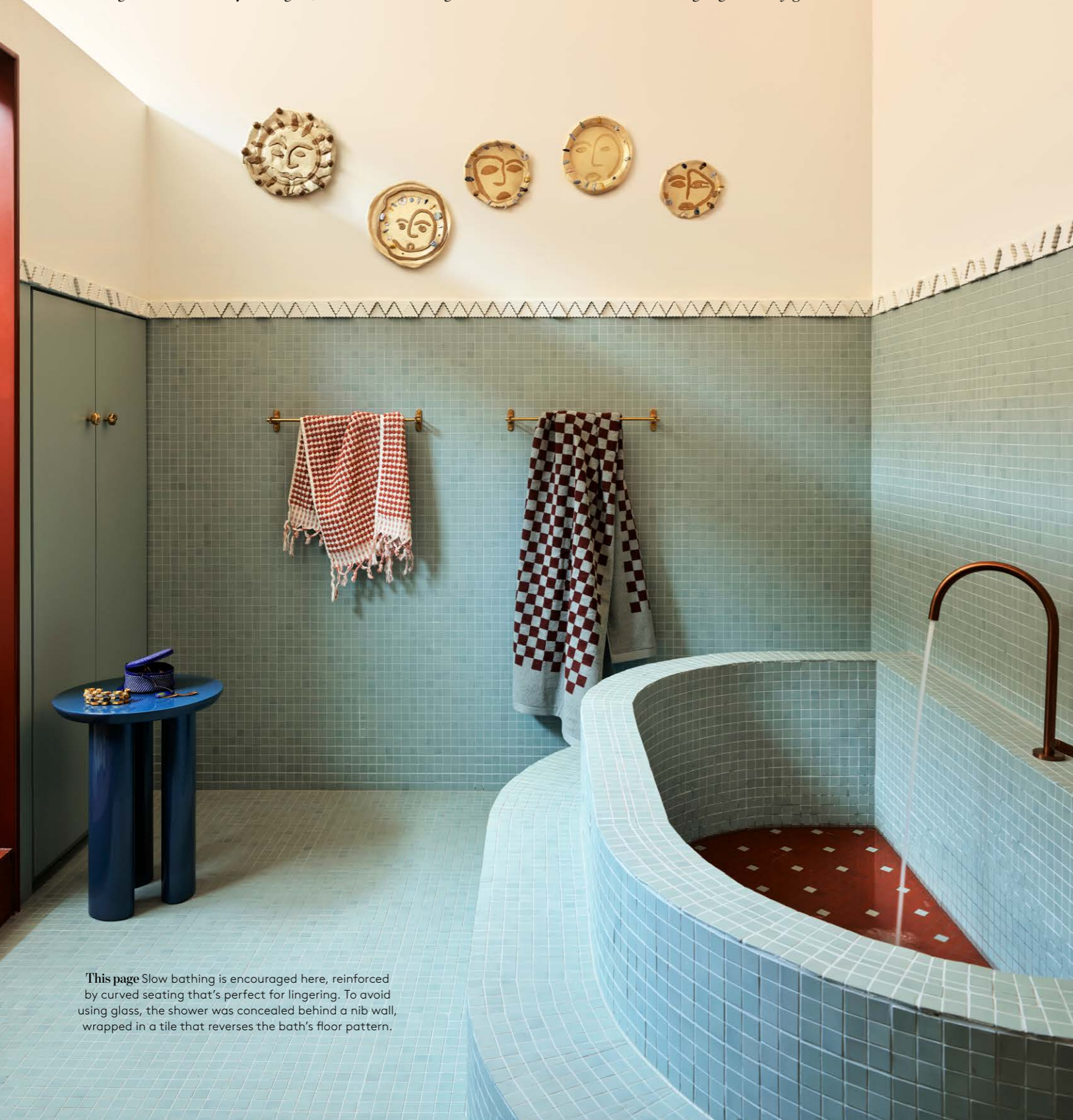
This page Slow bathing is encouraged here, reinforced by curved seating that’s perfect for lingering. To avoid using glass, the shower was concealed behind a nib wall, wrapped in a tile that reverses the bath’s floor pattern.

TESSELLATED TILES, STAINED GLASS AND CAREFULLY CONSIDERED DETAILS have transformed a Victorian weatherboard in Melbourne and sent it straight to the top of our nominations for Best Residential Interior. Pattern and pigment are expertly paired by Yasmine Ghoniem of YSG Studio, who headed up the Mo Jacobsen project with an expansive new extension that occupies two-thirds of the home. Her masterful selection of materials, including granite, marble, porcelain, hempcrete, lime render and maple timbers, has created sanctuary-like appeal tailored to the owners, an adventurous Egyptian and a minimalist Dane. “The home’s multiple timelines and Middle Eastern, Egyptian and Nordic references co-exist harmoniously with its Australian ties,” says Yasmine. Inclusions such as a winter lounge and a summer one, plus a hammam-style bathroom (this page) designed for two lucky teenagers, make it a sure thing for our Best Residential Bathroom gong as well. ysg.studio