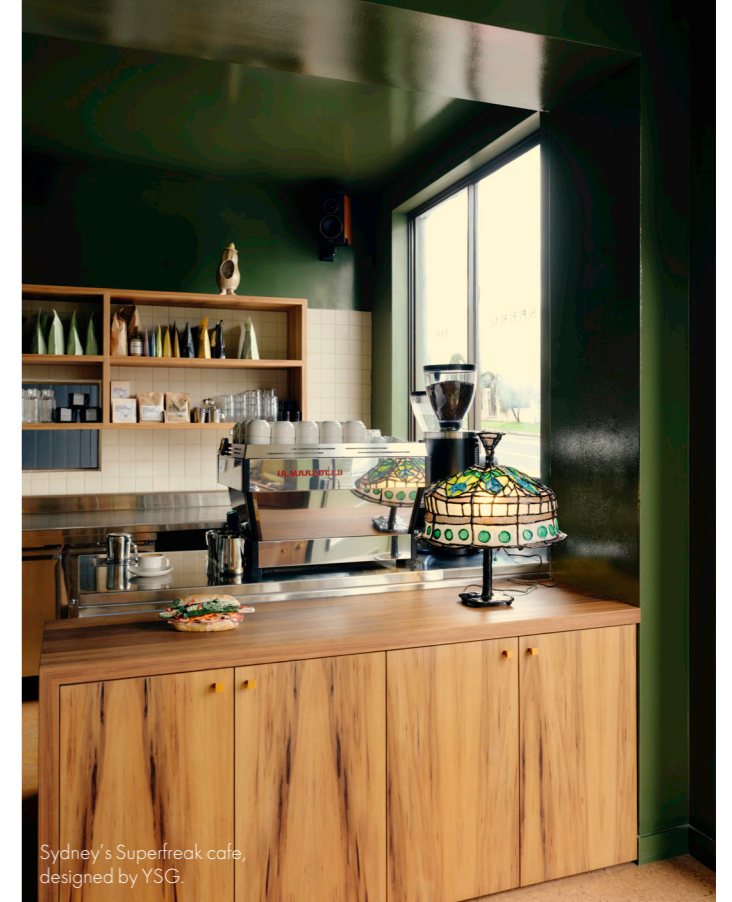
Sydney's Superfreak cafe, designed by YSG.