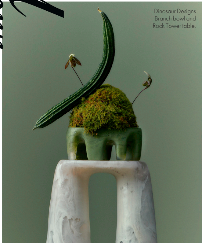
Dinosaur Designs Branch bowl and Rock Tower table.