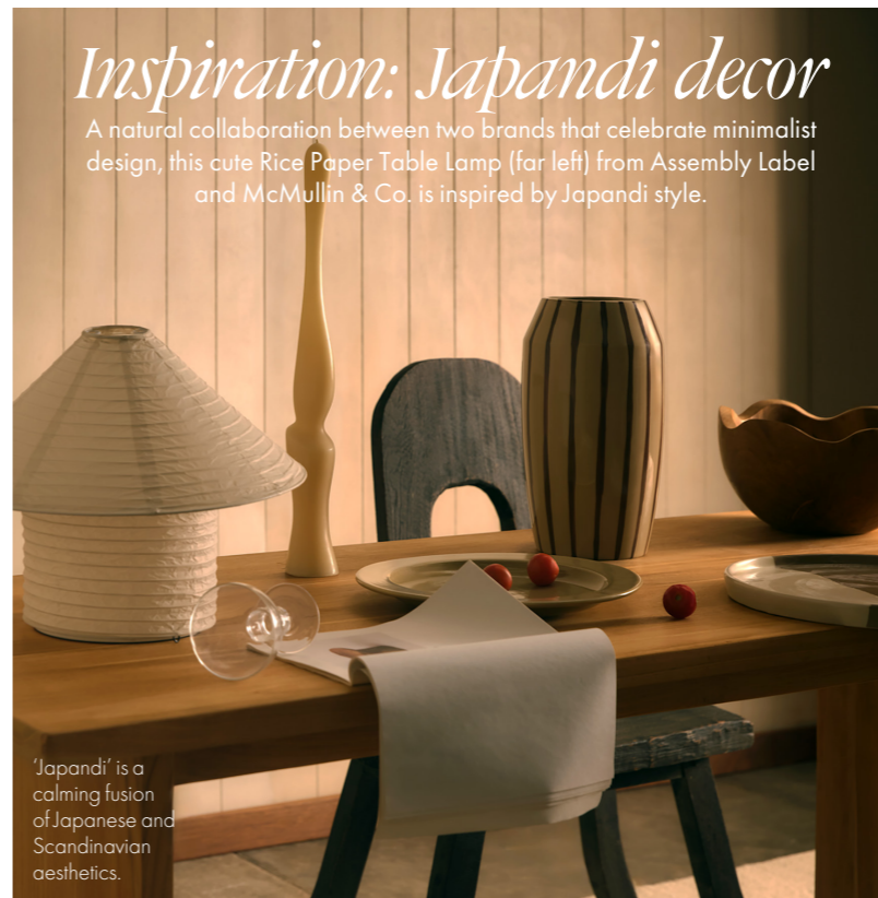
'Japandi' is a calming fusion of Japanese and Scandinavian aesthetics.

A natural collaboration between two brands that celebrate minimalist design, this cute Rice Paper Table Lamp (far left) from Assembly Label and McMullin & Co. is inspired by Japandi style.