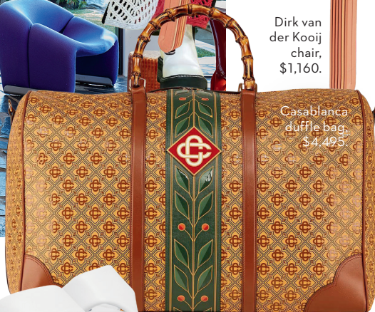
Casablanca duffle bag, $4,495