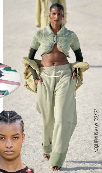
JACQUEMUS A/W '22/'23