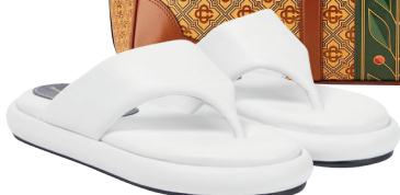
Proenza Schouler sandals, $715.

Souvenir spirit "The cult of personality reigns supreme – it's all about improvisation, shapeshifting to reinvent looks, and even the functions of select pieces and spaces. Colours seep into walls and tile-clad tabletops, scarves and vintage fabrics fashion lampshades, and retro finds are the new necessity because they stir your soul."