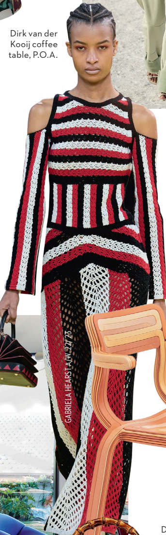
GABRIELA HEARST A/W '21/'23