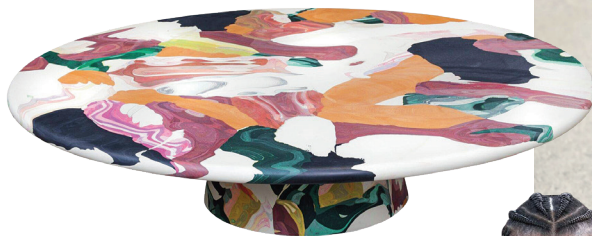
Dirk van der Kooij coffee table, P.O.A.