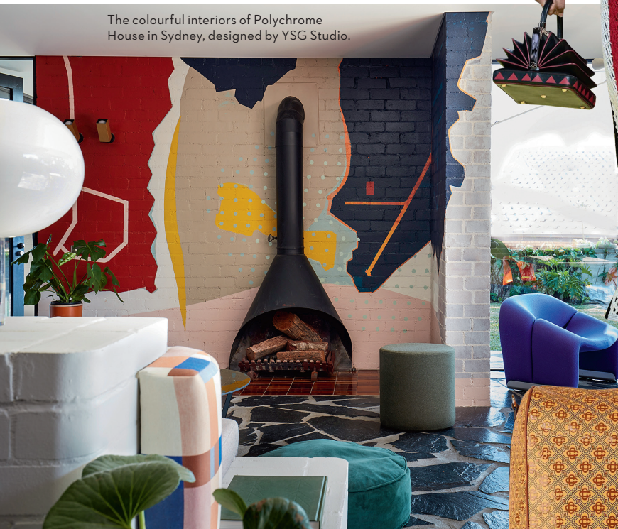
The colourful interiors of Polychrome House in Sydney, designed by YSG Studio.

"INTRODUCING THE JET-SET vagabond lifestyle, where the romance of travel is back with a vengeance. All paths lead to remote islands lapping up bacchanalian bohemia and wild new frontiers where free-spirited adventure soars. Make your home a global mix of layered holiday memories, so we can cling on to that feeling of freedom eternally. No one and nothing rules, except love."