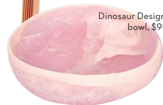
Dinosaur Designs bowl, $90.