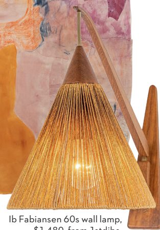
Ib Fabiansen 60s wall lamp, $1,480, from 1stdibs.