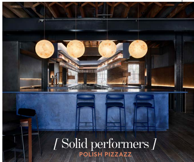
[ Solid performers ] POLISH PIZZAZZ

For my architectural concrete solutions I go to Concreative. Look no further for custom polished concrete benchtops for kitchens, bars and bathrooms. The team worked with us to create an enormous V-shaped 'juniper berry blue' bar in Surry Hills' Four Pillars (above). It steals the show! concreative.com.au