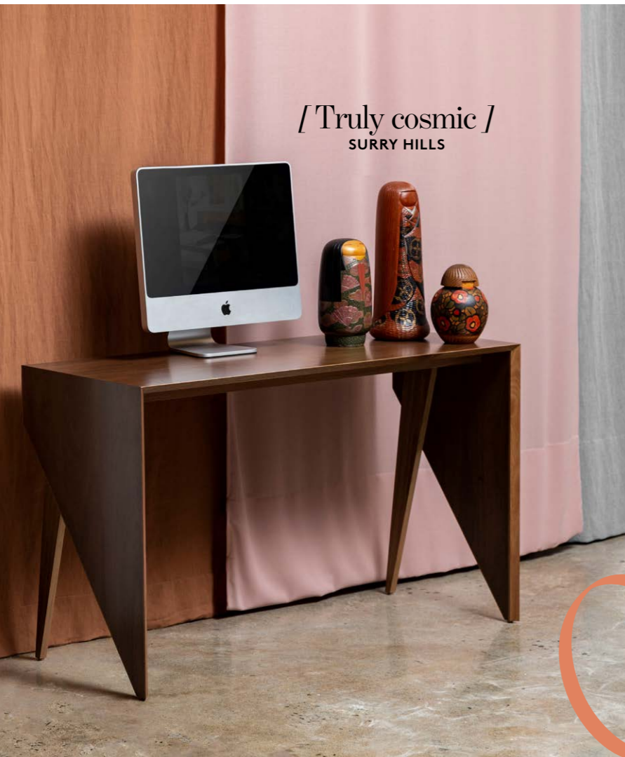
[ Truly cosmic ] SURRY HILLS

One of my favourite Sydney stores is Planet (left). From coffee and dining tables to shelving options (below), everything's made from premium Australian hardwoods. The store also stocks vintage Japanese ceramics, silk and velvet cushions, and organic cotton towels. It's a mocha haven. planetfurniture.com.au