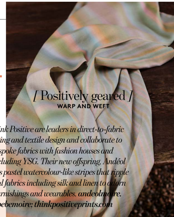
[ Positively geared ] WARP AND WEFT

Sydney's Think Positive are leaders in direct-to-fabric digital printing and textile design and collaborate to create bespoke fabrics with fashion houses and designers, including YSG. Their new offspring, Andéol Moiré, features pastel watercolour-like stripes that ripple across natural fabrics including silk and linen to adorn soft home furnishings and wearables. andeolmoire.com ; @bebemoire ; thinkpositiveprints.com