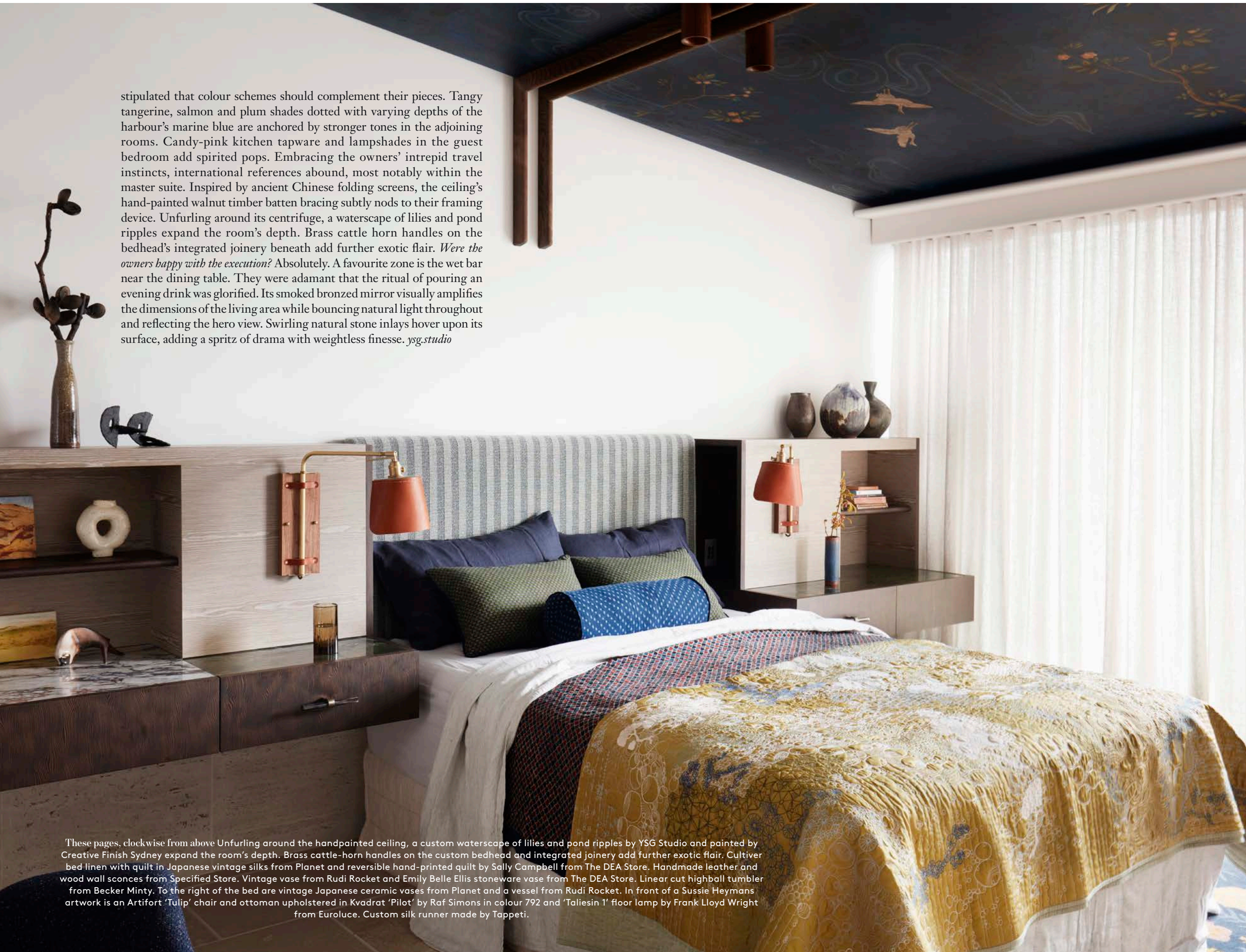
These pages, clockwise from above Unfurling around the handpainted ceiling, a custom waterscape of lilies and pond ripples by YSG Studio and painted by Creative Finish Sydney expand the room's depth. Brass cattle-horn handles on the custom bedhead and integrated joinery add further exotic flair. Cultiver bed linen with quilt in Japanese vintage silks from Planet and reversible hand-printed quilt by Sally Campbell from The DEA Store. Handmade leather and wood wall sconces from Specified Store. Vintage vase from Rudi Rocket and Emily Belle Ellis stoneware vase from The DEA Store. Linear cut highball tumbler from Becker Minty. To the right of the bed are vintage Japanese ceramic vases from Planet and a vessel from Rudi Rocket. In front of a Sussie Heymans artwork is an Artifort 'Tulip' chair and ottoman upholstered in Kvadrat 'Pilot' by Raf Simons in colour 792 and 'Talesin 1' floor lamp by Frank Lloyd Wright from Euroluce. Custom silk runner made by Tappeti.

stipulated that colour schemes should complement their pieces. Tangy tangerine, salmon and plum shades dotted with varying depths of the harbour's marine blue are anchored by stronger tones in the adjoining rooms. Candy-pink kitchen tapware and lampshades in the guest bedroom add spirited pops. Embracing the owners' intrepid travel instincts, international references abound, most notably within the master suite. Inspired by ancient Chinese folding screens, the ceiling's hand-painted walnut timber batten bracing subtly nods to their framing device. Unfurling around its centrifuge, a waterscape of lilies and pond ripples expand the room's depth. Brass cattle horn handles on the bedhead's integrated joinery beneath add further exotic flair. Were the owners happy with the execution? Absolutely. A favourite zone is the wet bar near the dining table. They were adamant that the ritual of pouring an evening drink was glorified. Its smoked bronzed mirror visually amplifies the dimensions of the living area while bouncing natural light throughout and reflecting the hero view. Swirling natural stone inlays hover upon its surface, adding a spritz of drama with weightless finesse. ysg.studio